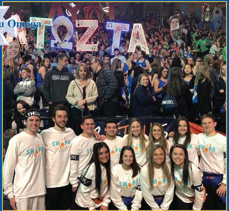
Brothers join with Zeta Tau Alpha to raise more than $254,000 at THON, which benefitted childhood cancer research.