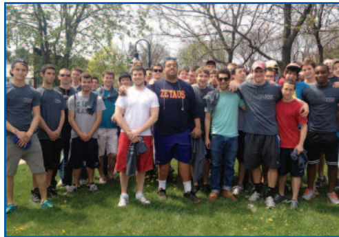
Brothers before the Out of Darkness Community Walk, an event to raise awareness for suicide prevention.

Academics have been a major focal point with our chapter. Every semester since the fall of 2010, we have improved our GPA. Last fall, we raised our GPA to a 3.04 and moved up 11 spots