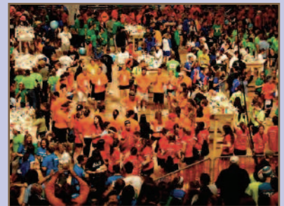
Alpha Tau Omega and Zeta Tau Alpha celebrate the last four hours of THON.

The 46-hour dancing marathon was a sold out event and Bryce Jordan Center was packed to capacity with nearly 15,000 participants. When all was said and done, THON raised an amazing $7.49 million, breaking last year's record by more than $800,000. All proceeds went to the Four Diamonds Fund, which helps families with the financial issues of pediatric cancer. Gamma Omega wishes to thank all of those who contributed to the Four Diamonds Fund and THON—what a great event!