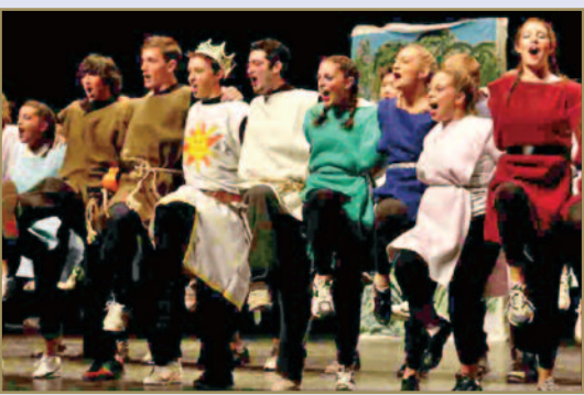
AT \Omega and AX \Omega members performed parts of Monty Python's Spamalot for Greek Sing on November 11.

Sorority. Our theme this year came from the animated movie Happy\ Feet so our float had penguins, an igloo, and a lot of ice. Although we did not place in the float competition, we had a great time with \Delta Z .