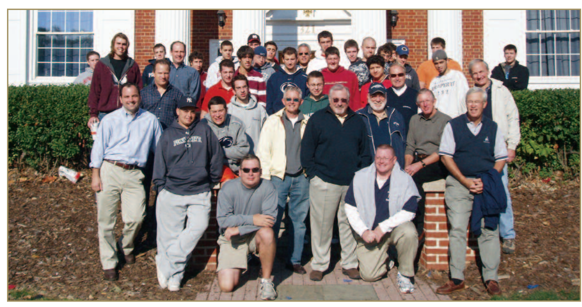
Alpha Tau Omega alumni and undergraduates reconnect at Homecoming.

A Publication of The Gamma Omega Chapter of Alpha Tau Omega