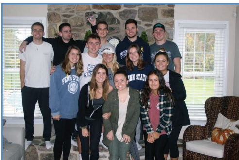
Some of our brothers went on ribboning trips with Zeta women to raise money for THON.