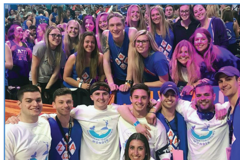
We are proud of our awesome dancers and THON chairmen who stood for 46 hours during the event.