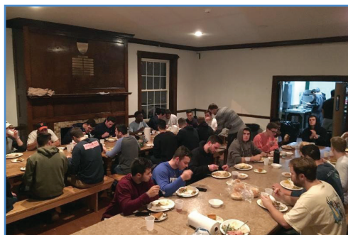
Our chapter enjoyed an early Thanksgiving dinner together before the holiday break.