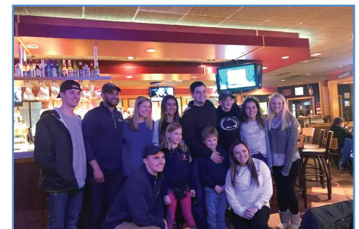
Gamma Omega dancers enjoyed a dinner with our THON families in Harrisburg.