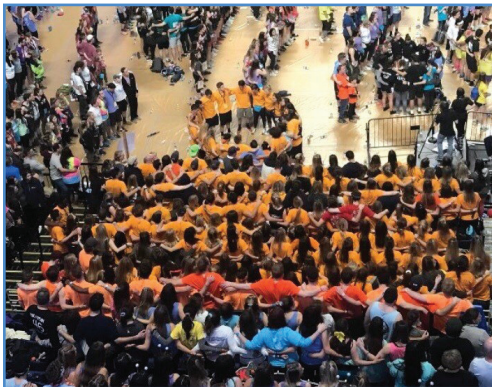
Our brothers, along with Zeta Tau Alpha, raised $239,104 toward the THON total of $10,151,663!