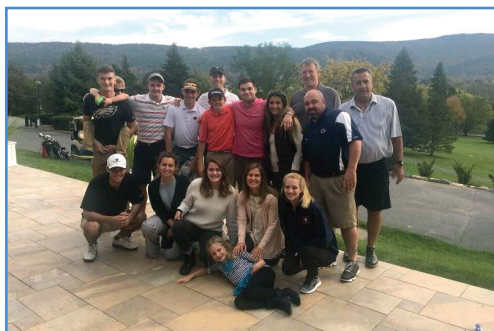
We attended Alpha Tau Omega and Zeta Tau Alpha's second annual golf tournament at the Mountain View Country Club last October.