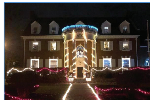
The chapter house was all lit up for the 2017 holiday season.