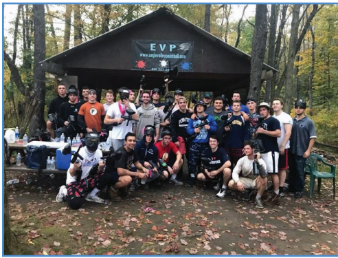
Members enjoyed bonding, being outdoors, and a friendly match of paintball at Eagle Valley Paintball in October.