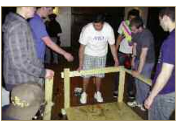
Members of AT\Omega , \Delta KE , and \Delta \Gamma build the chariot for Greek Week.