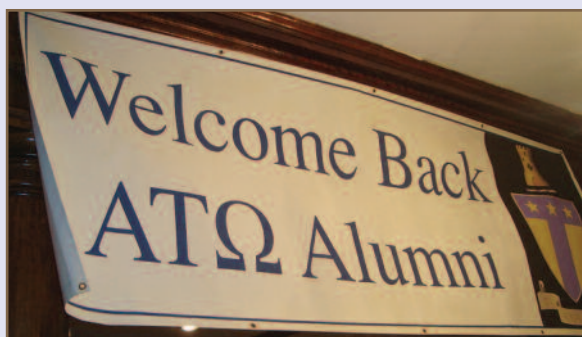
Alumni were greeted with a welcome banner at the chapter house for the Homecoming tailgate. The weather did not allow for traditional tailgating at the stadium.

Homecoming 2009 started off on a sour note with Mother Nature covering the State College area with a record snow fall. Regardless, several brave and daring Taus made their way to the chapter house for the Friday night cocktail party.