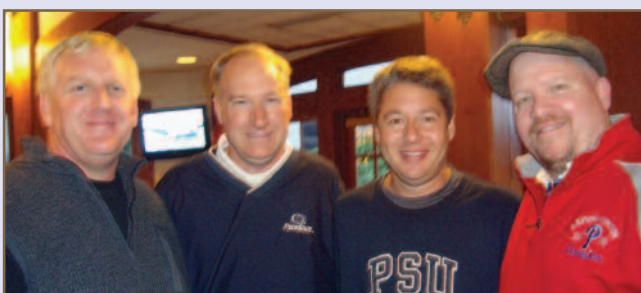
Alumni enjoy reconnecting with brothers at Homecoming 2009.